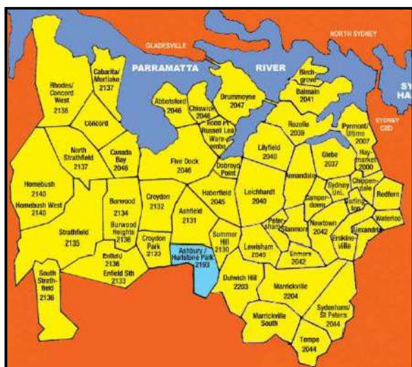
RPA POST CODE MAP