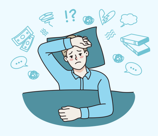
Have unmet complex needs